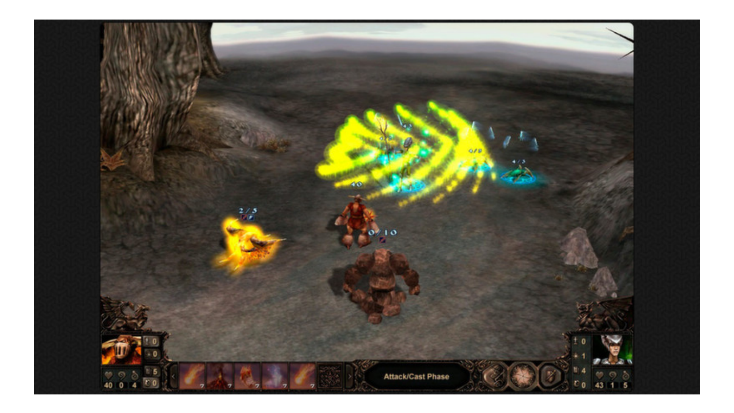
Etherlords II Activation Key Crack

Download ->>->> <a href="http://bit.ly/2NIbUki">http://bit.ly/2NIbUki</a>